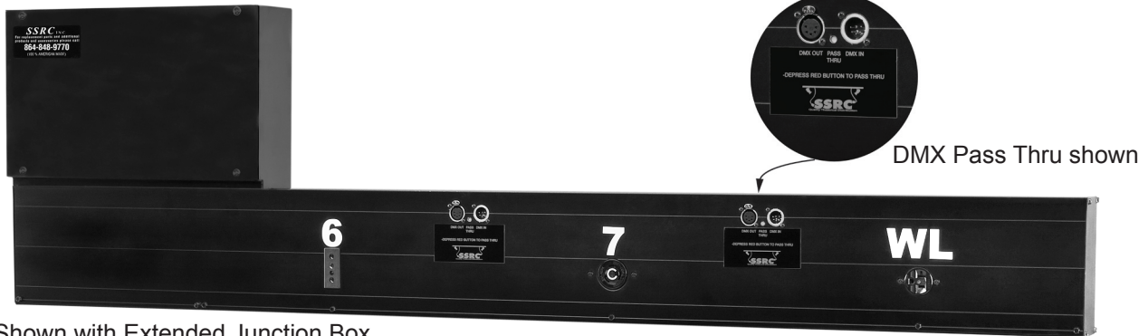
Shown with Extended Junction Box